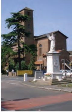
Gilbert Scott's Church of St Michael's today