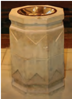
The baptismal font

From the choir gallery, looking towards the sanctuary, the beauty and design of the church can be fully appreciated. Looking upwards the decorated roof can be seen with the division between the pre-war building and its completion in 1960. The internal walls of the church are dressed in brown Hornton stone.