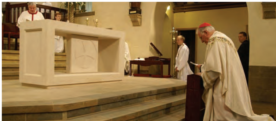
Dedication of the new altar, November 2006