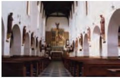
St Michael's interior before reordering work