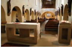
The nave from the sanctuary