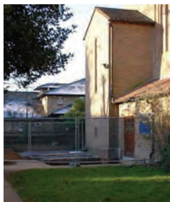
Foundations in place for the narthex