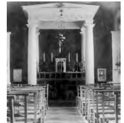
Altar in the old church Feltham Road