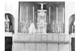
The old church in Feltham Road (demolished in 1968)