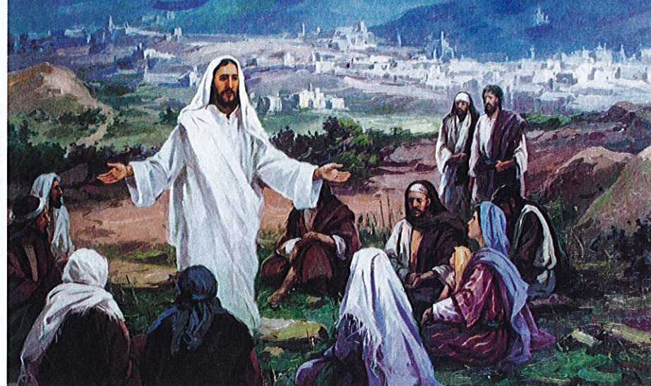
Printed image of Jesus preaching to the crowd, in Grace Church, Chiangmai, Thailand.