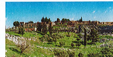
Umm Qais is an ancient city of the Decapolis, in present-day northern Jordan. It is located in the extreme north-west of the country, where the borders of Jordan, Israel and Syria meet.

Prepare your answer to someone who asks you, "Why are you a Christian?" or, "Why do you go to church?" Be ready to give it.