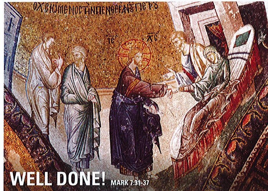
Christ Healing Peter's Mother-in-law: mosaic in Cora Church, Istanbul.

Jesus is in Gentile territory, preaching and healing. This shows that his message is not confined to a Jewish territory or audience, but has a universal meaning.