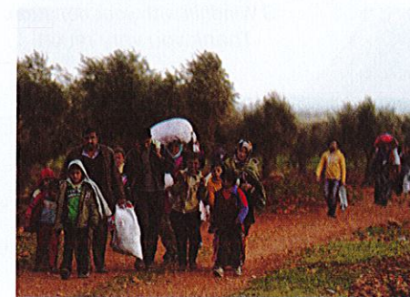
Internally displaced people walk with their belongings in Afrin, Syria.

Look at the news reports; remember that wars, earthquakes and flooding are mentioned in apocalyptic passages as announcing the end of the world. But this has not happened yet and we do not know when it will. It is our responsibility to make the world a better place here and now. Do what you can.