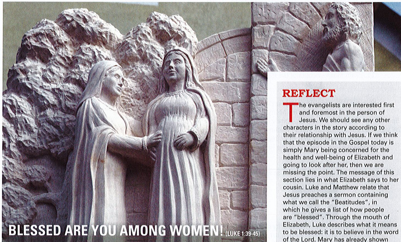
Visitation of the Blessed Virgin Mary, Mary's Way in Klenovnik, Croatia

The first two chapters of the Gospel according to Luke deal with the conception and birth of Jesus (and John the Baptist) and we usually refer to them as the Infancy Narrative.