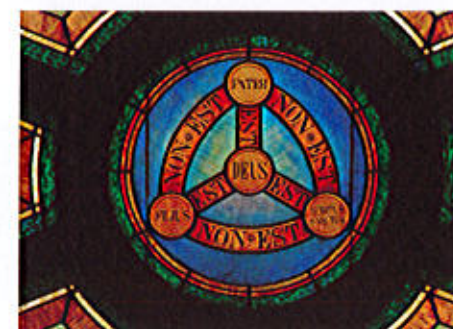
Stained glass window depicting doctrine of the Holy Trinity in Latin

"It is not easy to find a name that will suitably express so great an excellence, unless it is better to speak in this way: the Trinity, one God, of whom are all things, through whom are all things, in whom are all things." (St Augustine)