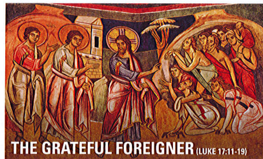
Fresco in church in Parma, Italy, depicting Jesus healing the ten lepers

Jesus' journey to Jerusalem continues southwards towards the hostile region of Samaria. Pilgrims on the way to the Holy City often encountered difficulties from the Samaritans, who had been the enemies of the Jewish people for more than 500 years.