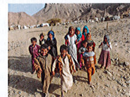
Yemeni children in refugee camp in Yemen

When next you see a news item about refugees, say to yourself, "Jesus, Mary and Joseph have been through that sort of experience."