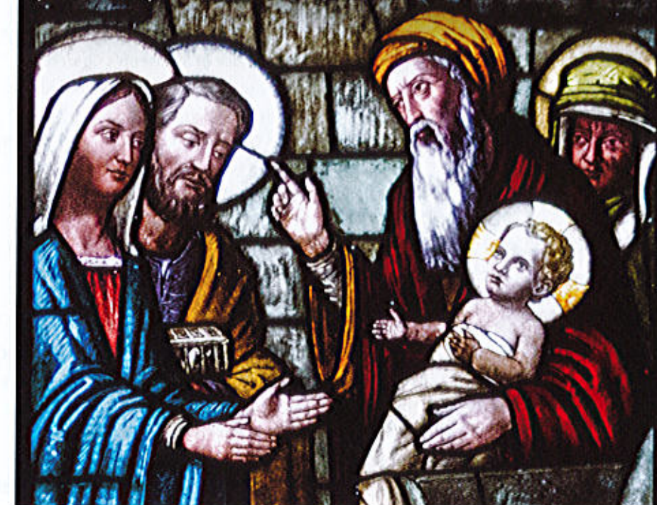
A stained glass window in the Church of San Vittore Martire in Italy, depicting the presentation of the Lord

The opening two chapters of Luke's Gospel are known as his Infancy Narrative . However, they are more of a theological overture to the main work than an actual history. They have also been referred to as the Gospel in miniature , as they present, often very subtly, hints of how the story of Jesus will unfold.