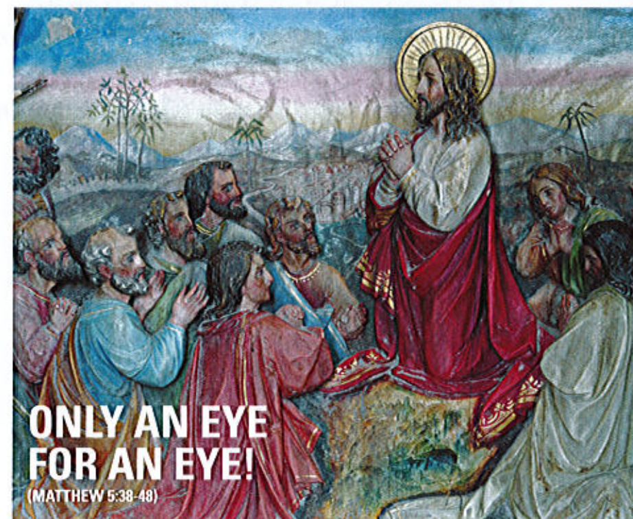
A depiction of the Sermon on the Mount

Matthew continues his presentation of the teaching of Jesus in the Sermon on the Mount. The teaching about an eye for an eye is often held up as illustrating the superiority of the Gospel over the supposed savagery of the Hebrew Bible (the Old Testament).