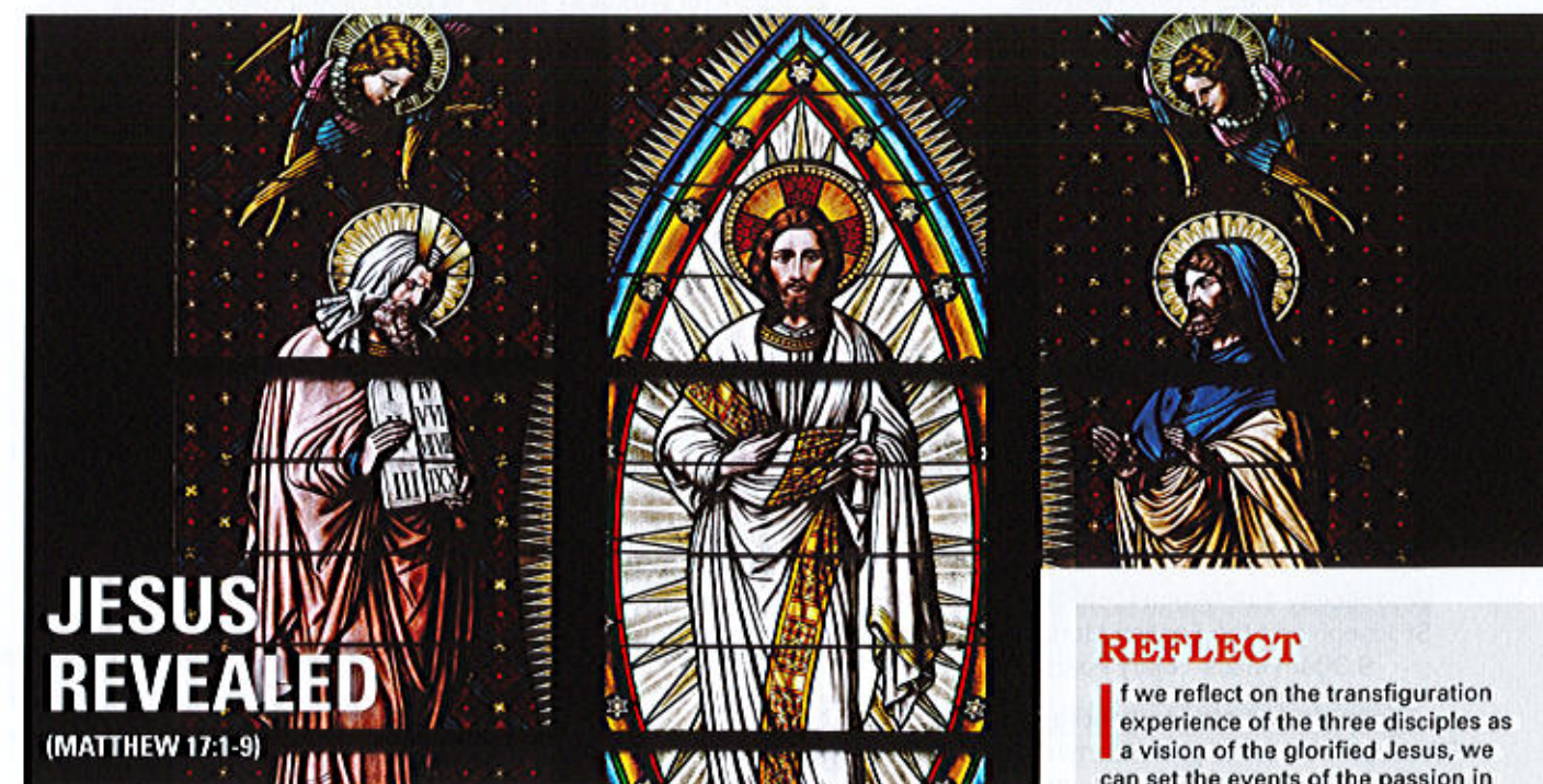
Transfiguration on Mount Tabor, depicted in stained glass in Votivkirche (Votive Church), Vienna