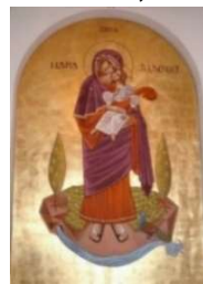
Mary, Mother of the City