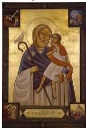
Joseph of the House of David

St. Joseph's Church, Lamb's Buildings, Lamb's Passage, off Bunhill Row, London EC1Y 8LD