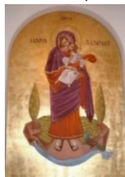
Mary, Mother of the City