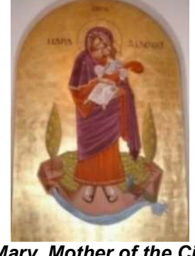
Mary, Mother of the City