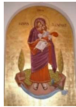
Mary, Mother of the City