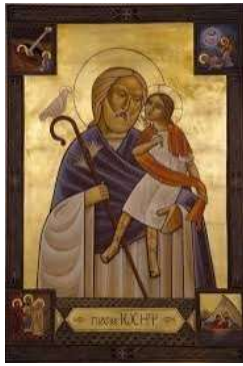
Joseph of the House of David

St. Joseph's Church, Lamb's Buildings, Lamb's Passage, off Bunhill Row, London EC1Y 8LD