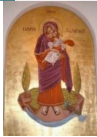
Mary, Mother of the City