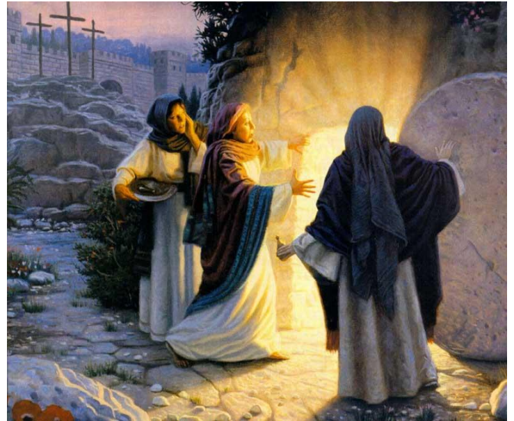
"He must rise from the dead" John 20: 1-9