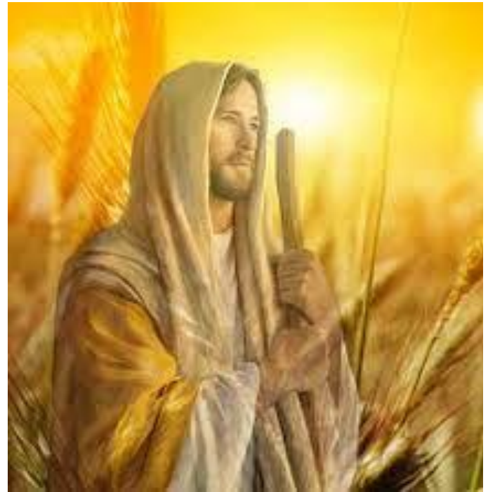
'A sower went out to sow' Matthew 13: 1-9