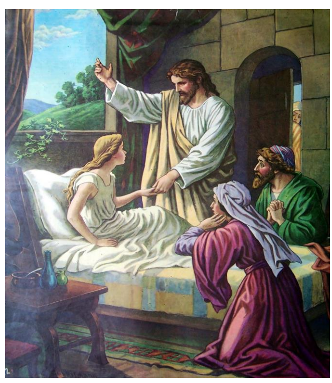
"He cured many who were suffering from diseases of one kind or another" Mark 1: 29-39