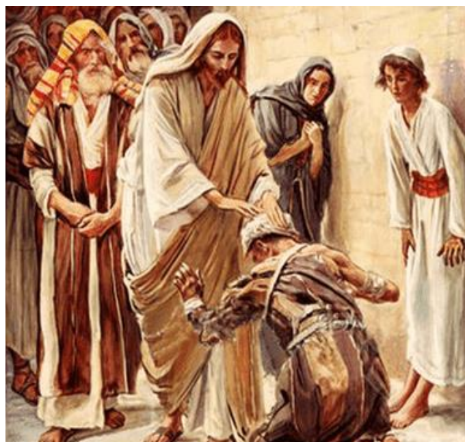
"The leprosy left him at once and he was cured" Mark 1: 29-39