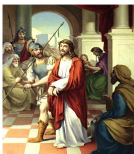
Jesus is condemned to death