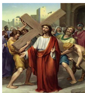
Jesus takes up his cross