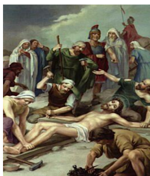
Jesus is nailed to the cross