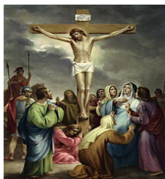
Jesus dies on the cross