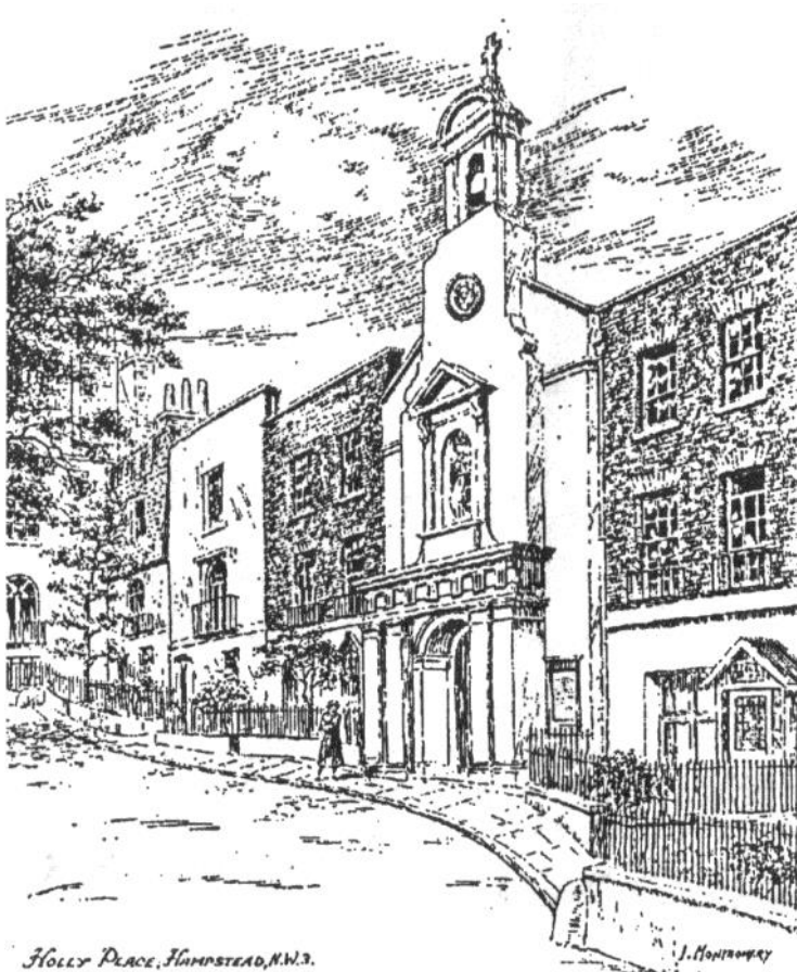
HOLLY PLACE, HAMPSTEAD, N.W.3.