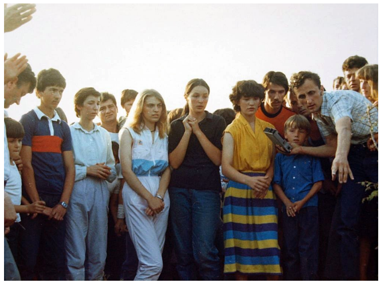
The first photo of the Medjugorje visionaries. Photo taken on the hillside of Podbrdo, Medjugorje on 28th June 1981.

In Western Herzegovina in the area bordering Croatia, just south west of the city of Mostar, in the former republic of Yugoslavia on June 24th 1981, the Feast Day of St John the Baptist, all has fallen more quiet than usual. This is a holy day of obligation and work on the stony and thorn-strewn farmland and the patchy network of vineyards has stopped in this staunchly Catholic community. Following a violent thunderstorm in the morning the stultifying heat throughout the day threatened to split the rocks in the mountainous terrain of the region of a remote village with an unpronounceable name. The name of the village – or more correctly collection of hamlets – is Medjugorje..