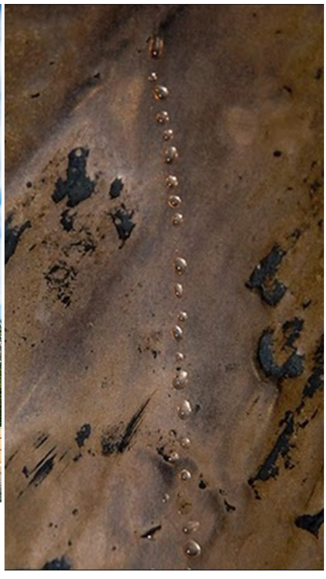
Droplets of water continuously cascade down the bronze of the statue of the Risen Saviour.

This phenomenon of the droplets of water has been attracting quite some attention over the years since it began in 2002. Whether in frozen conditions, or in the summer months when everything around is parched dry, the flow of droplets of water continues. It has ceased to flow for some days on various occasions, and for three weeks in September 2010. The occasions when it ceases to flow appear to have nothing to do with moisture content in the surrounding vicinity, as on some of these occasions quite heavy rainfall has taken place. Metallurgists, structural engineers, geologists, geophysicists and meteorologists have all considered this enigma but no explanation has been forthcoming. The Medjugorje visionaries have not commented on this.