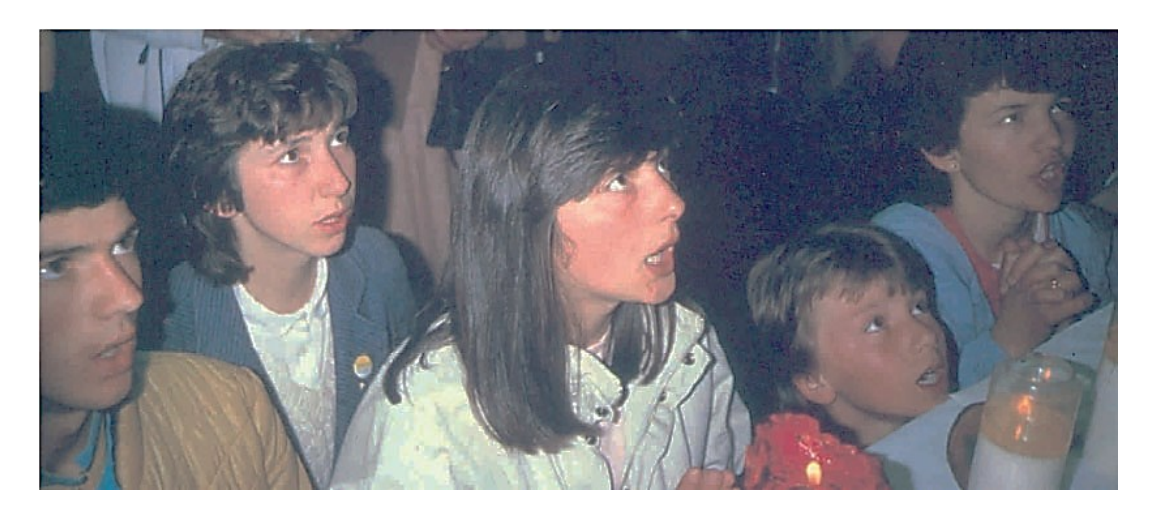
St Paul's Catholic Church, Harefield ... Friday, January 26th 2024 at 7.00pm