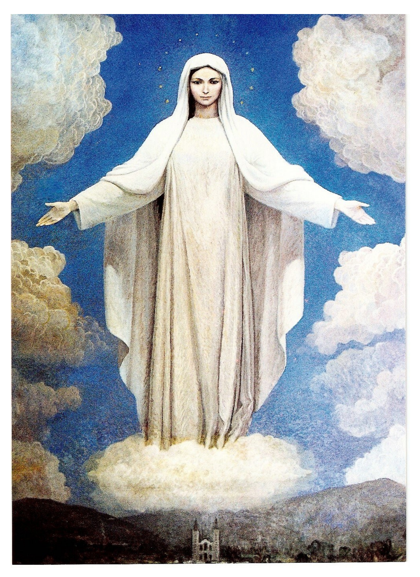
Our Lady of Medjugorje by Carmelo Puzzolo