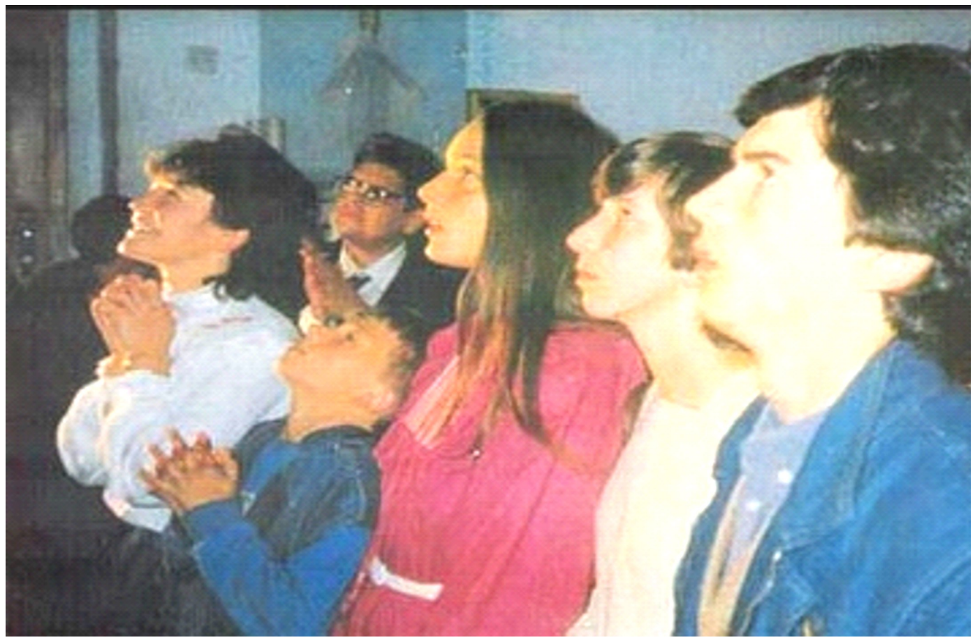
The visionaries during apparitions