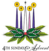
The "O Antiphons" of Advent

Sunday cycle Readings Year A Weekday readings Year 1 Divine Office Week 4