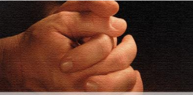
The Comeback Prayer Group