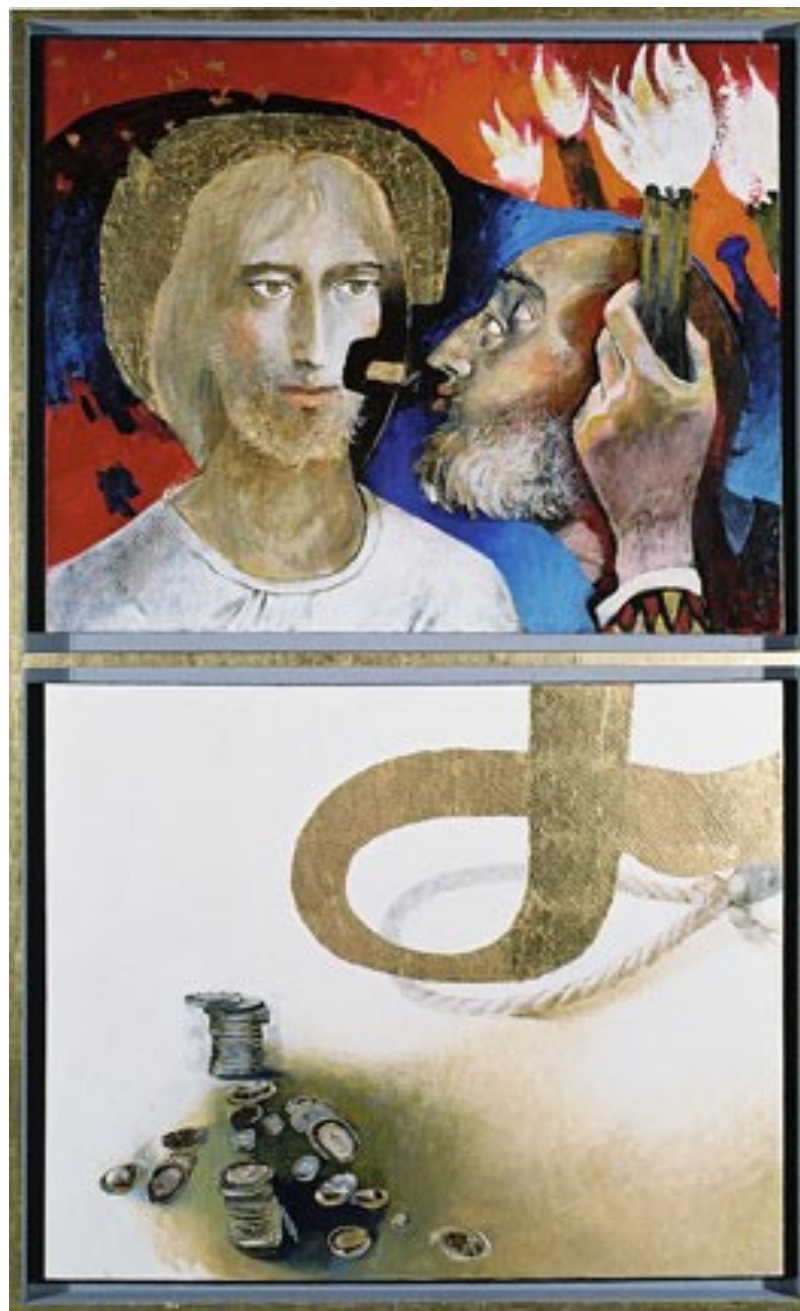
Le Baiser de Judas (Judas's Kiss) and Les trente deniers (The thirty silver pieces)