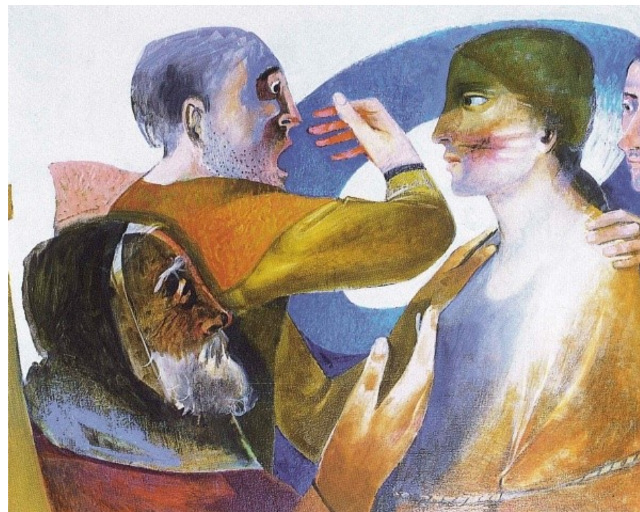
La Gifle (The Slap)

Slowly, I give thanks to the Lord for the time spent together and for the comfort of having felt his loving touch.