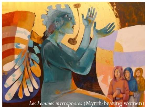
Les Femmes myrrophores (Myrrh-bearing women)

After the sabbath, and toward dawn on the first day of the week, Mary of Magdala and the other Mary went to visit the sepulchre. And all at once there was a violent earthquake, for the angel of the Lord, descending from heaven, came and rolled away the stone and sat on it. His face was like lightning, his robe white as snow. The guards were so shaken, so frightened of him, that they were like dead men. But the angel spoke; and he said to the women, 'There is no need for you to be afraid. I know you are looking for Jesus, who was crucified. He is not here, for he has risen, as he said he would. Come and see the place where he lay.' Matthew 28: 1-6