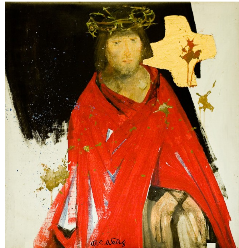
Ourrage à Jesus Roi (Mocking of Jesus the King) Musée d'art sacré contemporain, St Pierre de Chartreuse, France