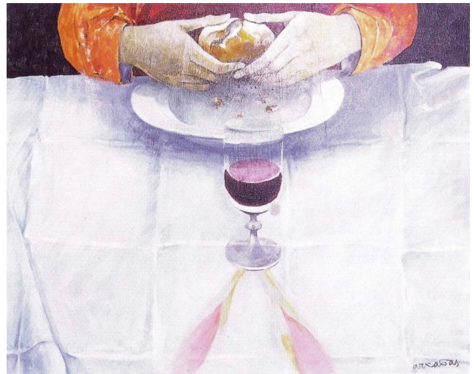
'Ceci est mon corps' ('This is my body')

When I am ready, I conclude my prayer with a slow sign of the cross.