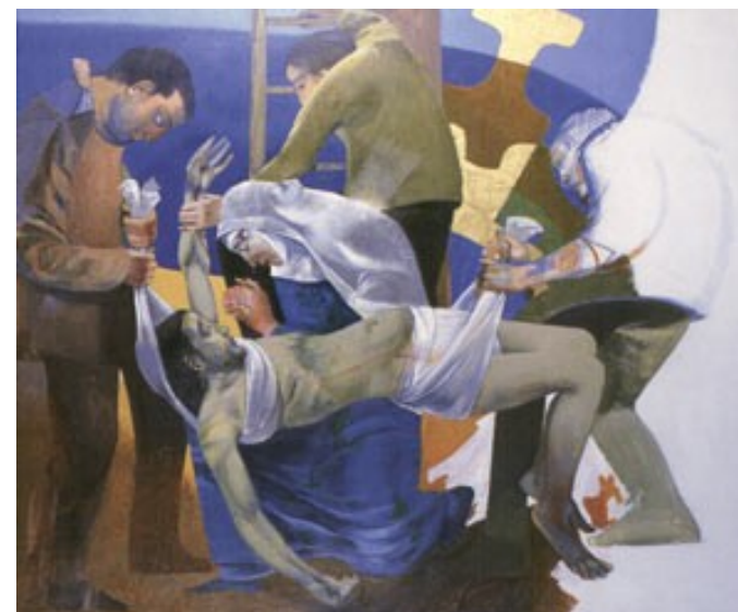
Descente de croix (Descent from the cross)