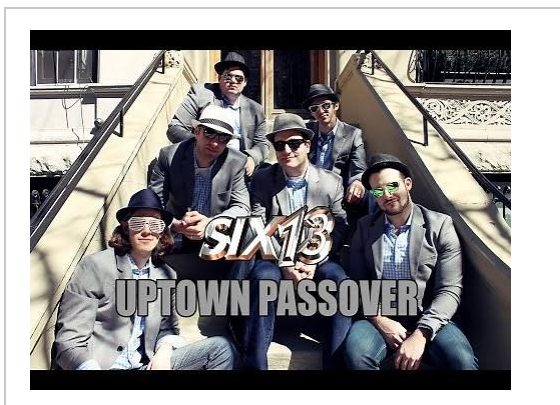
Six13 - Uptown Passover (an "Uptown Funk" adaptation for Pesach)

https://www.youtube.com/watch?v=7Q7Jo7FkLH4