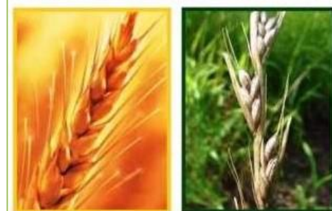
Wheat and Tares