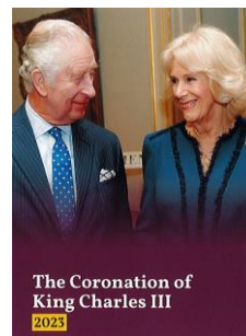
The Coronation of King Charles III 2023

SEPARATION SUPPORT GROUP: The next meeting for those undergoing separation or divorce will be held on Wed 24 th May 4.30pm in the presbytery. If you need support and would like to join the group, please do contact the presbytery.