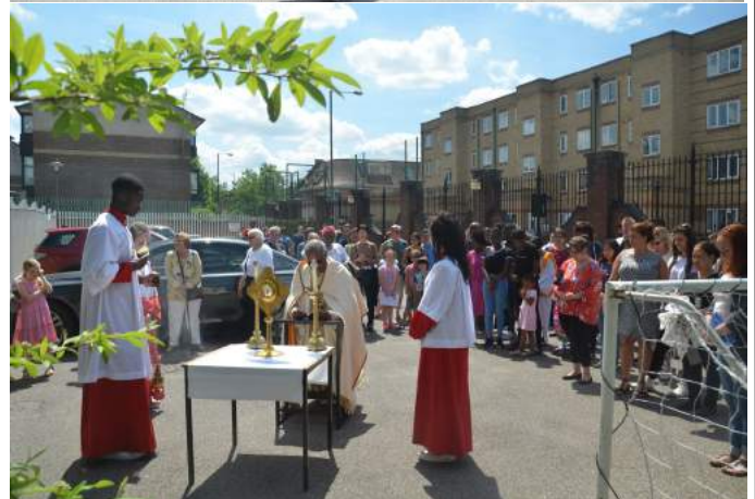
CORPUS CRISTI procession last Sunday