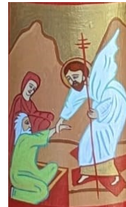
In hell he rescued Adam & Eve;