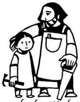
Joseph the Worker

"I am the true vine...cut off from me you can do nothing." John 15:1. 5