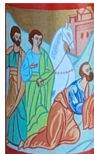
This spirit converted merciless Saul into the great apostle Paul