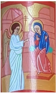
Announced by Gabriel.