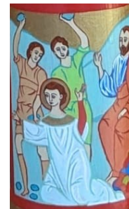
And moved Stephen to offer his life freely to his persecutors.