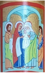
Presented in the Temple