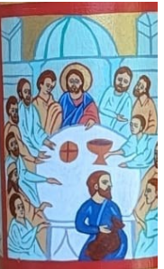
Shared his Passover with his disciples;