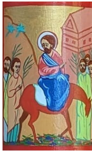
Therafter he entered Jerusalem;