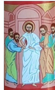
Later he showed doubting Thomas his wounds,