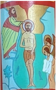
Baptised in the Jordan,