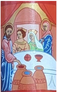
Jesus' life was dedicated to his selfless mission, changing water into wine,