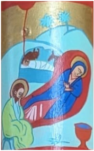
Born in a stable.