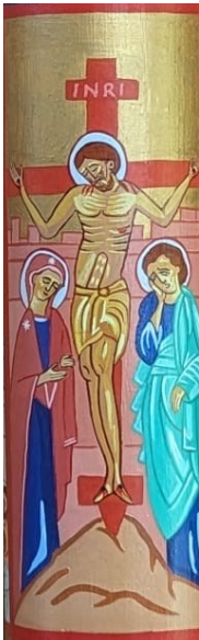
And was crucified,