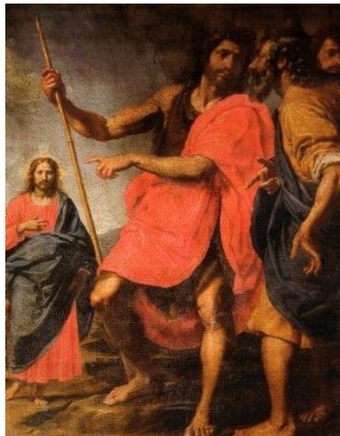
John the Baptist leads St Andrew to Jesus

By appointment, see the newsletter for details of the baptism preparation course