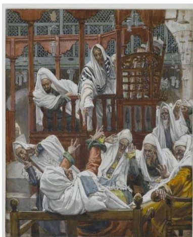
"Le possédé dans la Synagogue" by James Tissot

By appointment. Usually at 1pm on Saturdays. See the newsletter for details of the baptism preparation course.