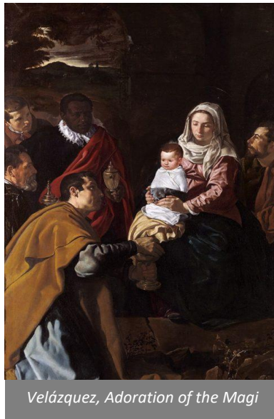
Velázquez, Adoration of the Magi

By appointment, see the newsletter for details of the baptism preparation course