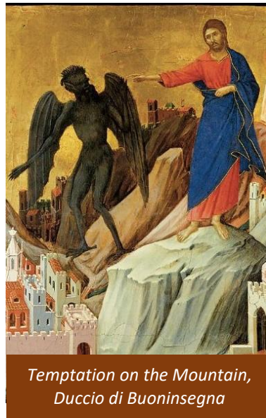
Temptation on the Mountain, Duccio di Buoninsegna

By appointment. Usually at 1pm on Saturdays. See the newsletter for details of the baptism preparation course.