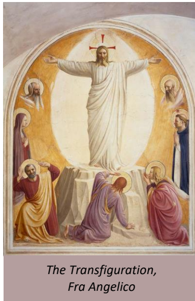
The Transfiguration, Fra Angelico