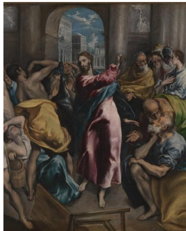
The Cleansing of the Temple, El Greco