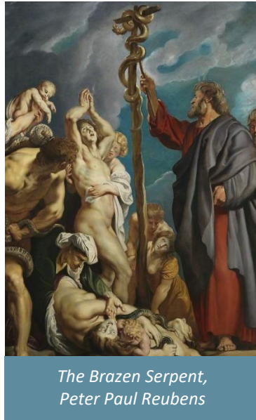
The Brazen Serpent, Peter Paul Reubens