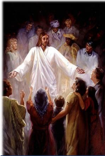
The risen Jesus appears to his disciples

By appointment. Usually at 1pm on Saturdays. See the newsletter for details of the baptism preparation course.