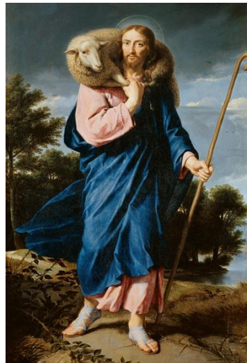
The Good Shepherd by Philippe de Champaigne

By appointment. Usually at 1pm on Saturdays. See the newsletter for details of the baptism preparation course.