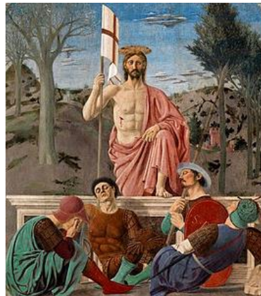
The Resurrection by Pireo della Francesca

By appointment. Usually at 1pm on Saturdays. See the newsletter for details of the baptism preparation course.