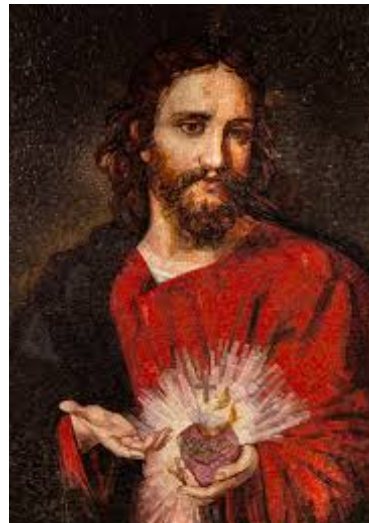
Mosaic of the Sacred Heart of Jesus from St Louis Cathedral

By appointment. Usually at 1pm on Saturdays. See the newsletter for details of the baptism preparation course.