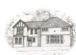
St John Fisher Hill Cottage, Shire Lane, Chorleywood, WD3 5NH

Livestreaming: https://www.churchservices.tv/rickmansworth