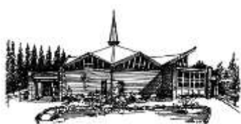
St John The Evangelist Berry Lane, Rickmansworth, WD3 7HG