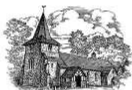
Our Lady Help of Christians 5 Park Road, Rickmansworth, WD3 1HU