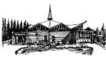
St John The Evangelist Berry Lane, Rickmansworth, WD3 7HG