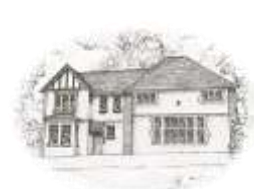
St John Fisher Hill Cottage, Shire Lane, Chorleywood, WD3 5NH

Livestreaming: https://www.churchservices.tv/rickmansworth