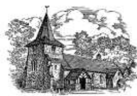
Our Lady Help of Christians 5 Park Road, Rickmansworth, WD3 1HU