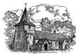
Our Lady Help of Christians 5 Park Road, Rickmansworth, WD3 1HU