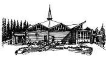
St John The Evangelist Berry Lane, Rickmansworth, WD3 7HG