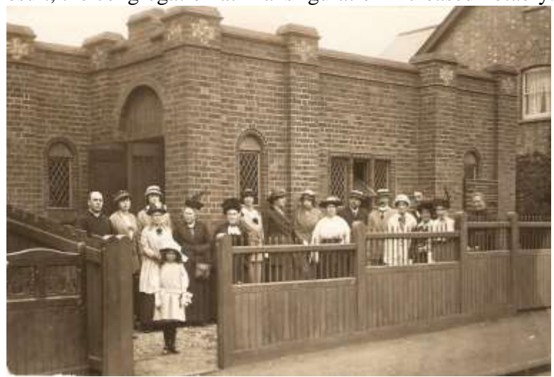
An 'iconic' photograph of the congregation in August 1914

The first edition of this magazine described the opening of the Transfiguration church in January 1914 . The number of Catholics in Stevenage was small and there was no resident priest. Then in July 1914, WW1 began. Belgium was invaded and many refugees came to the UK from Flanders. Some were billeted in Stevenage and most were Catholics. As a result, the congregation at Transfiguration increased notably.