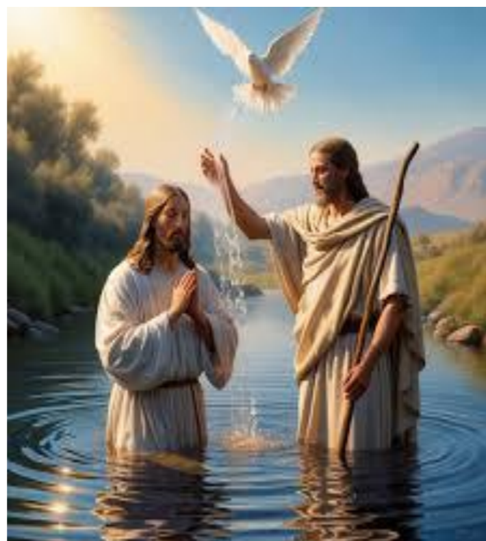
” This is my beloved Son, with whom I am well pleased” Matthew 3: 13-17

Today the Church celebrates the Feast of the Baptism of Our Lord . This feast brings to an end the season of Christmas. Ordinary Time lasts from the day after this feast to the Tuesday before Lent.