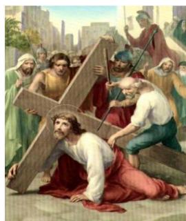
Jesus falls the first time

CONFESSIONS Saturdays, 5.30pm to 6pm in the Repository