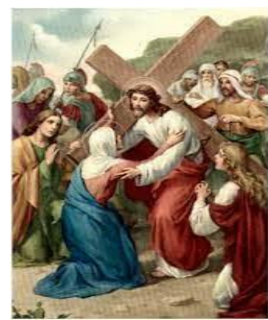
Jesus is met by Mary his mother

MASS FOLLOWED BY STATIONS OF THE CROSS FRIDAYS During LENT only