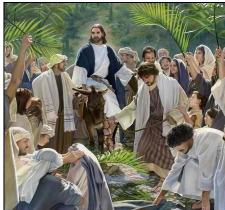
"Are you the King of the Jews?" Matthew 26:14-27:66