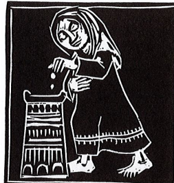
BUT SHE GAVE FROM HER WANT MK 12: 44

Jesus then observes how Jewish pilgrims are making their contributions to the temple treasury. Jesus calls attention, however, to a poor widow who makes the smallest of contributions—two coins of little value. Jesus upholds the poor widow's offering for his disciples' consideration, commending her because her small offering was an act of profound generosity, giving from her livelihood rather than her surplus. To give from our livelihood is not only an act of generosity, it is also an act of trust in God. We can only give from our need if we trust that God will provide